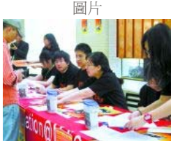
學生在校園內募捐狀況。

HTML版 昔日明報(Archive) 主頁 要聞 加國新聞 社區新聞 中國 國際 港聞 經濟 體育 影視 副刊 工商專業